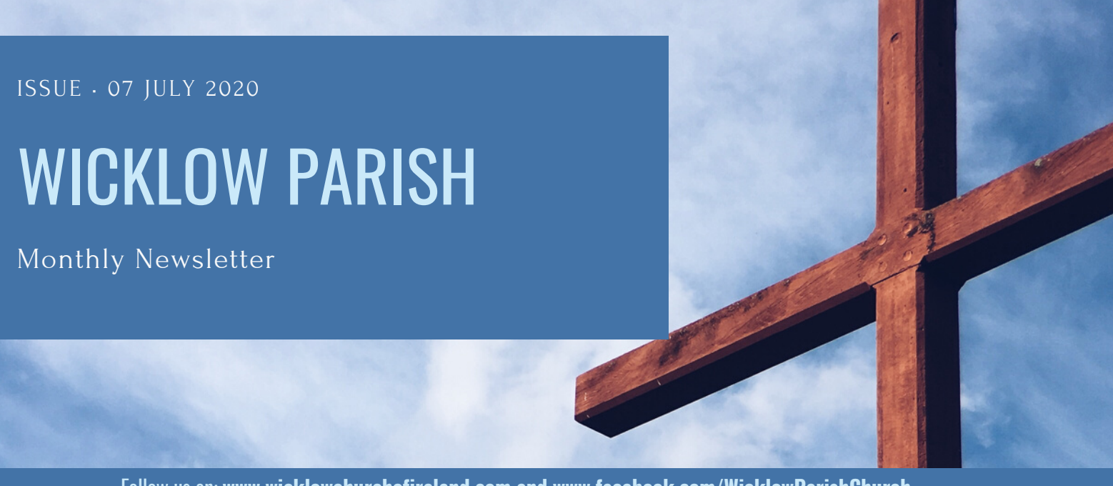
Follow us on: www.wicklowchurchofireland.com and www.facebook.com/WicklowParishChurch